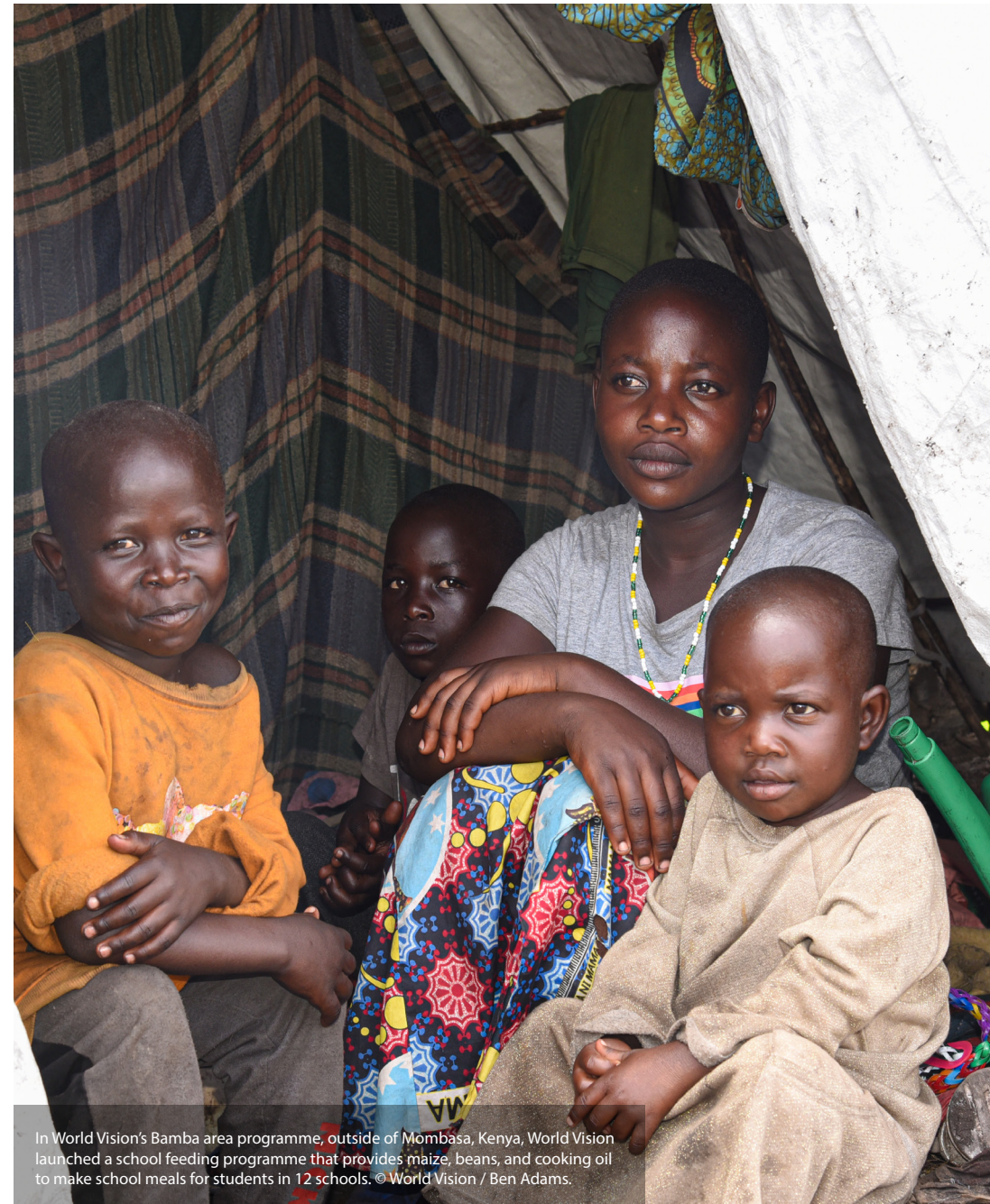
In World Vision's Bamba area programme, outside of Mombasa, Kenya, World Vision launched a school feeding programme that provides maize, beans, and cooking oil to make school meals for students in 12 schools.